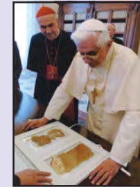
Pope Benedict XVI inspects the Bodmer Papyrus, Gospels of St. John and St. Luke (175-225 AD), during their presentation to the Vatican Library. PTWF was instrumental in the prized documents' acquisition.